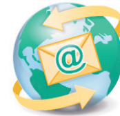
Sage E-marketing for Sage CRM

With Sage E-marketing for Sage CRM, users can quickly create personalised and targeted emails using over 90 highly professional email templates that cover all communication needs. Templates can be edited quickly and easily directly from within Sage CRM allowing you to personalise them with your logo, contact details, hyperlinks and call to action.